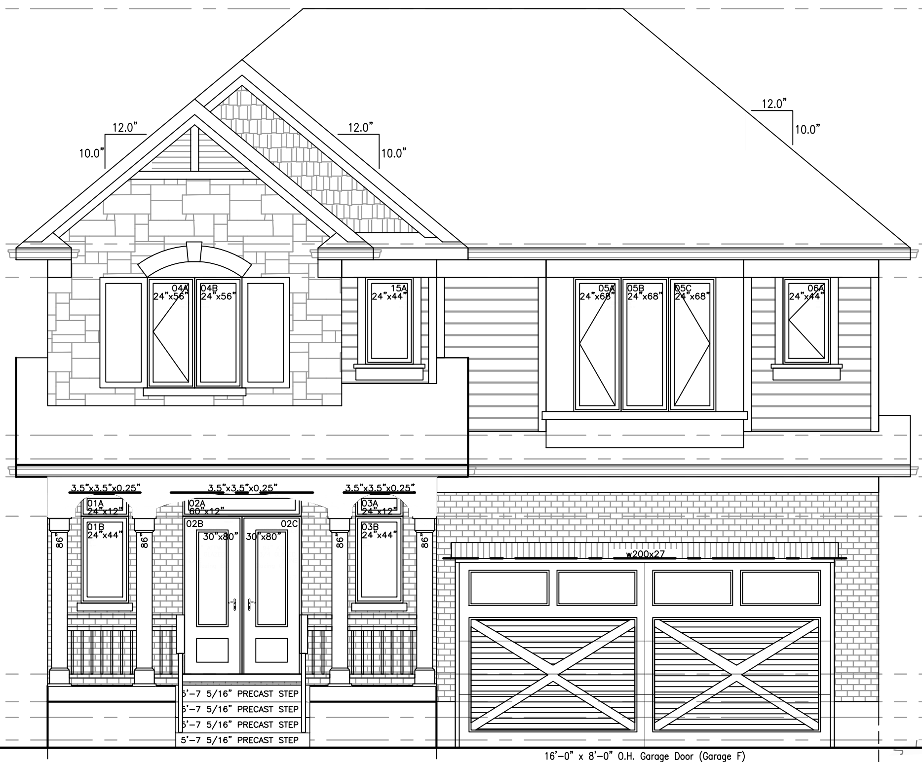
Front Elevation SCALE 1/4" = 1'-0"